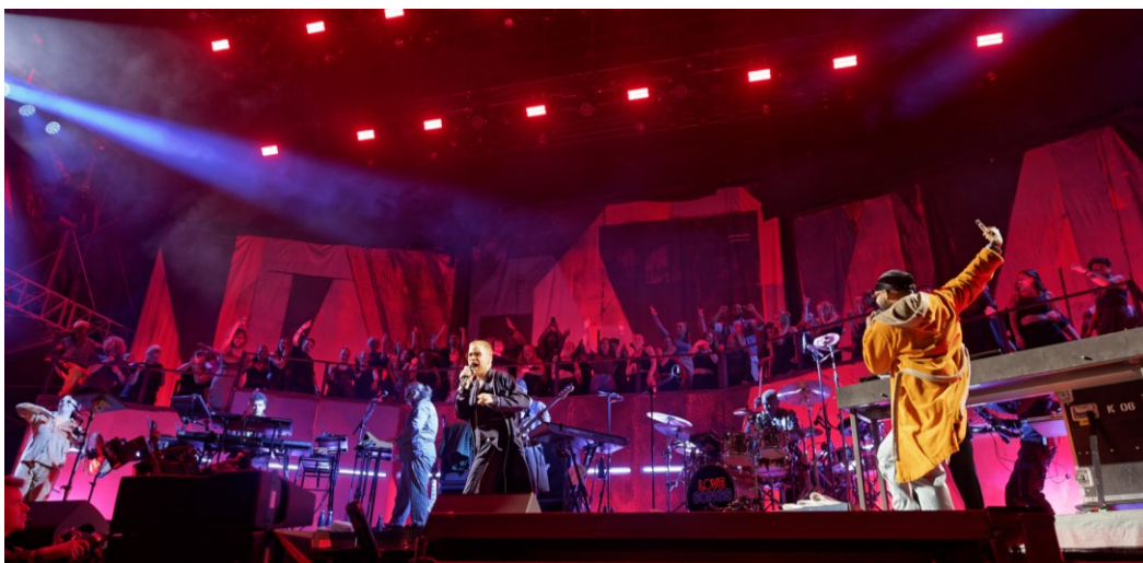
The performance at the NDR 2 Plaza Festival was also the grand finale of Peter Fox’s “Love Songs” tour

Wedemark/Hanover, November 2023 – Around 20,000 music fans enjoyed the live party of the year at the NDR 2 Plaza Festival on 8 September 2023. The headline act for this open-air event in Hannover was Peter Fox, who electrified the crowd with an extremely danceable mix of dancehall, hip hop, Afro beat and R&B. His voice could always be heard clearly and his song lyrics were easy to understand – despite his band’s powerful, high-energy sound. This was due not only to the skills of the experienced sound crew, but also to the high-quality digital wireless microphone systems from the Sennheiser Digital 6000 series.